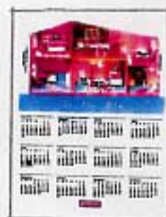
2010 LUNDBY CALENDAR