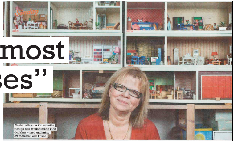
English translation of caption inset in the photo above:

Editor’s Note: We thank Elisabeth Lantz, Sweden, and the editors of the magazine, Expressen Söndagsbilaga, for their permission to reprint a section of an article that appeared in March of 2012. The English translation from the original Swedish is by the Google translator.