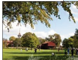
At the edge of the forest where the city of Växjö meets the countryside, S:t Sigfrid's Folk High School brings its students and its visitors closer to nature.