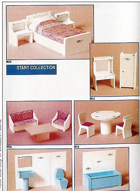
The Start Collection from the 1990 catalog.