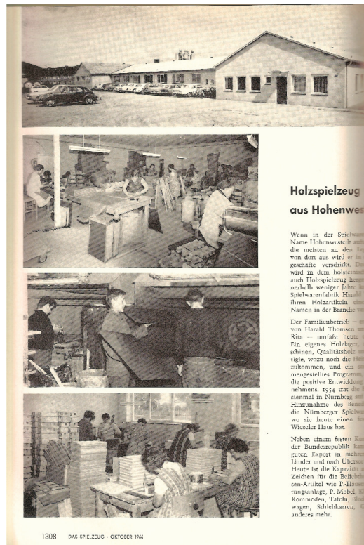
Holzspielzeug aus Hohenwestedt

"Holzspielzeug aus Hohenwestedt," meaning "Wooden Toys from the Town Hohenwestedt," is the title of a favorable two-page article published by the journal, Das Spielzeug , meaning Toys, in October 1966.