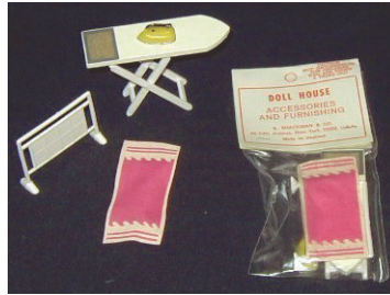
The dollhouse items in this B. Shackman & Co. package include an ironing board, iron, rug, and towel rack exactly like those offered by Barton toys. The package indicates that the items were made in England.

One of the items we've won recently includes a packaged set of bathroom and laundry items that surely was made by Barton for Shackman. If any readers have information to share about either Caroline's Home or Barton items with a Shackman label, please email us.