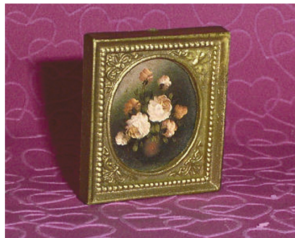
This little Lundby still-life sold for about $25 on eBay recently.