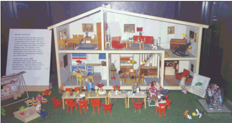
Party-time! Shown is the birthday celebration theme displayed in a 1960s Lundby dollhouse, one of the houses in the Bethnal Green exhibit.

A Quarterly Newsletter Published for Members of the We Love Lundby Club