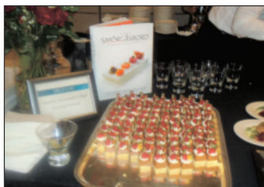
The caramel tart with cream and raspberry tasted divine!

We hope to see Chef Frida again during our visit to the House of Sweden in September! ♥