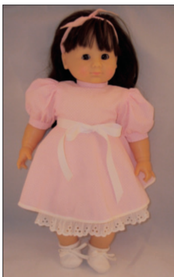
This Lundby doll is for sale. Interested persons should contact me at toysmiles@aol.com .

It was pure speculation that I suggested that this Lundby doll might have been manufactured by Corolle, just because of the physical resemblance. That supposition remains doubtful now because a former employee of the Pleasant doll company emailed me last December and stated that she had purchased an 18-inch doll in a box marked Lundby of Sweden, made in West Germany. Her fascinating story provides clues as to the possible manufacturer of the larger Lundby dolls.