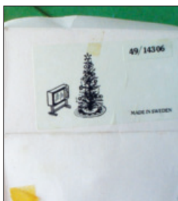
Sears packaging for Lundby sets.