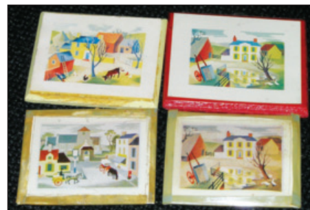
Four Barton wall pictures.