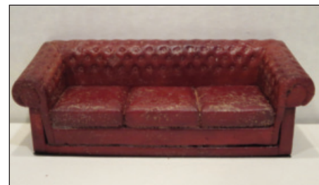
Before and after versions of the Chesterfield sofa. From the Morse collection.