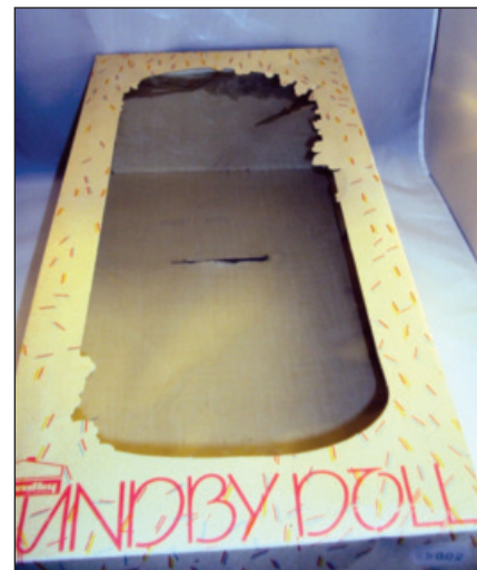
Lundby doll box.