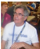
Paul Simon

5:30 p.m. on Saturday, Sept. 27 (NOT Sept. 20 as previously announced) at the former Delmonico Event Center at 3220 Federal. Yes